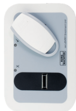
III.2: Reading-placement of the transponder

Lay the transponder onto the RFID reading area of the secuENTRY pro 7073 ENROLMENT unit.