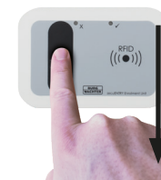
III.5: Direction of movement while reading the finger

The software will guide you through the next steps. To register your fingerprint, you need to move your finger in direction of arrow over the sensor.