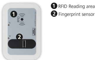
III.1: Reading areas

The following image shows the reading areas of the ENROLMENT unit: